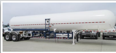
10,600 GAL, 265 PSI EXPORT VESSEL