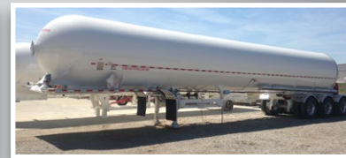
13,600 GAL, 265 PSI PROPANE/ NH3 VESSEL