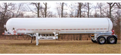
10,600 GAL, 265 PSI PROPANE/ NH3 VESSEL