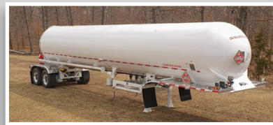
11,600 GAL, 250 PSI PROPANE VESSEL